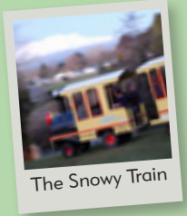
The Snowy Train